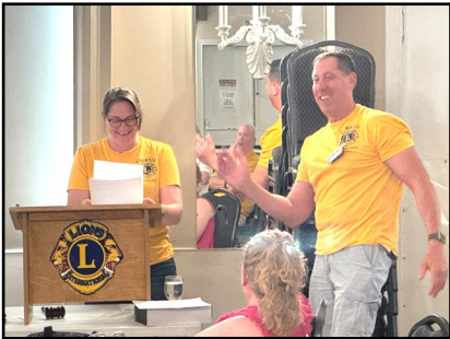
Installation Night 2024 - 2025 Club Officers