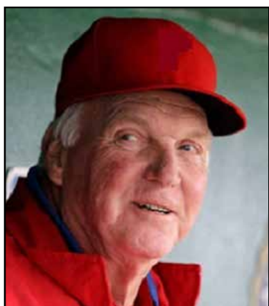
Charlie Manuel will be signing from 11 a.m. to 1 p.m.